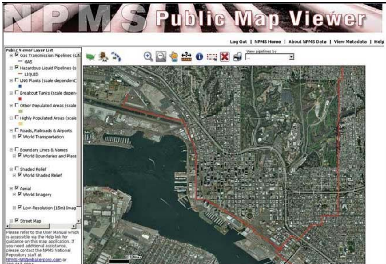
Screen shot: National Pipeline Mapping System, Public Map Viewer( https://www.npms.phmsa.dot.gov/ )