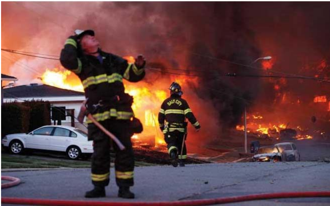
A massive fire roars through a mostly residential neighborhood in San Bruno, Calif., following a pipeline explosion that killed eight people and incinerated the neighborhood.

Despite these facts, several recent pipeline incidents have highlighted the need for communities to be adequately prepared for pipeline emergencies. In September 2010, a gas pipeline rupture and the subsequent ignition in San Bruno, Calif., caused eight fatalities, injuries to more than 60 people, the complete destruction of 38 homes, and damage to 70 other homes. An investigation of the incident revealed that the local emergency responders were not adequately prepared to respond to the pipeline emergency.