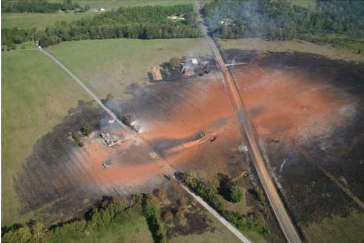
An aerial view of the impact of a natural gas pipeline rupture and fire in Appomattox, Va., in 2008, that demolished two houses and damaged buildings 400 yards away.